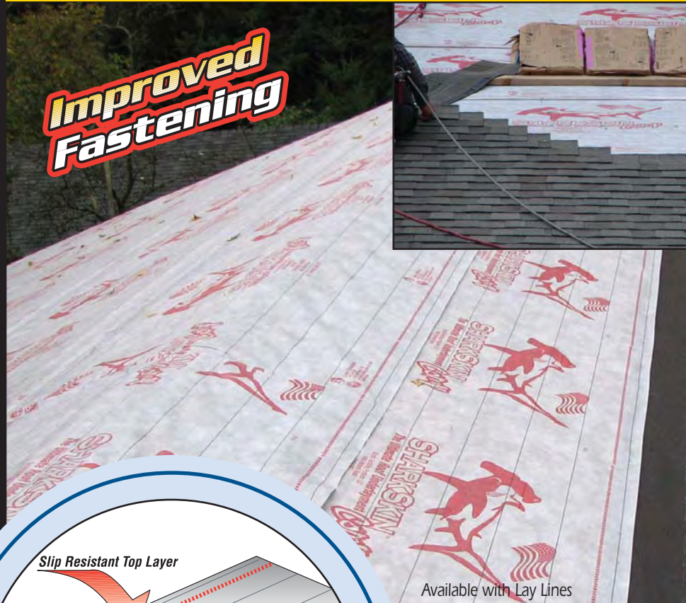
Available with Lay Lines